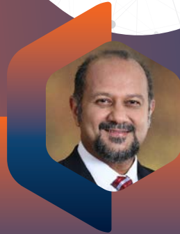
Gobind Singh Deo, Minister of Communications and Multimedia, Malaysia