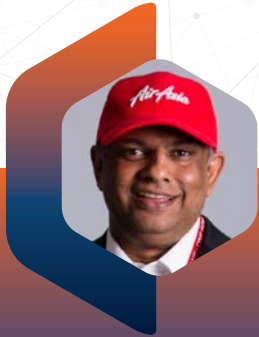
Tony Fernandes, CEO, AirAsia Group